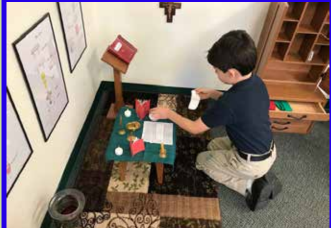
Altar area in atrium

The Good News of Jesus Christ and His love for each of us fills us with hope and peace. As we wait for the time when we will be together again in the atrium, we know that Jesus is here with us now. The lighting of a candle reminds us that, “Jesus is the light of the world, and there is no darkness that can put out that light.”