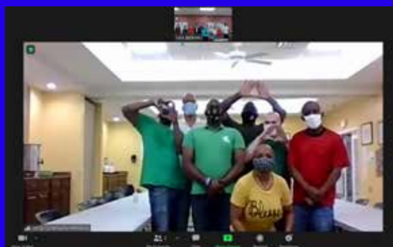
Trinity House Zoom session