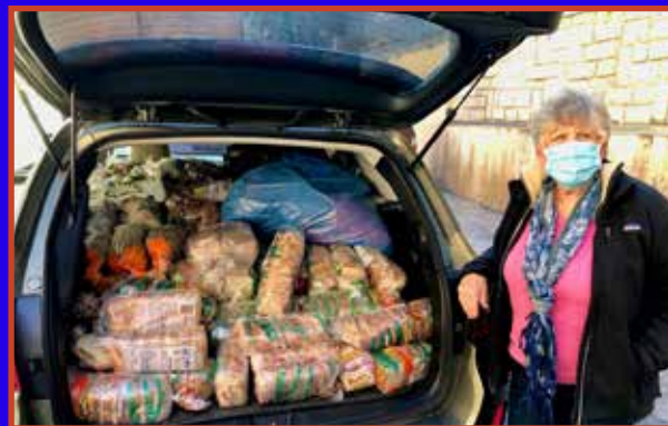
Carload of food for sandwich-making

For the last 34 weeks, the students and families have been