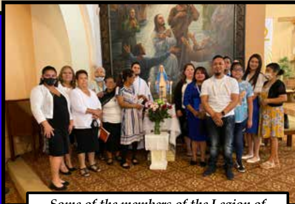
Some of the members of the Legion of Mary