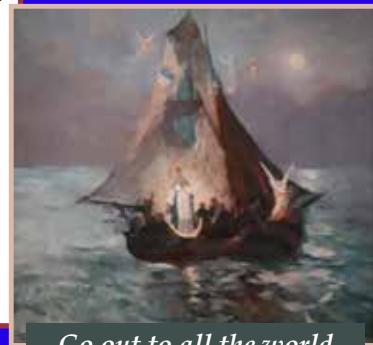
Go out to all the world and tell the good news. (Mark 16:15)

Apostolic Contemplatives ... we realize that we are called to something much deeper as Marists; more than committing ourselves to specific devotions, we are called to become Mary's devotion in the midst of the Church (Fr. Edwin Keel, SM)