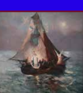
Barque of Mary Painting