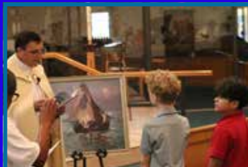
Marist Blessing of Children Born & Unborn