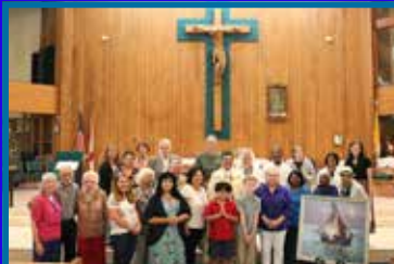
Marist Laity commitment ceremony attendees