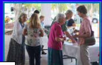
Marist Laity celebration