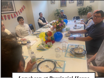
Luncheon at Provincial House

At the conclusion of my studies, the Marist Community in Washington, DC organized a luncheon in recognition of my accomplishments. The Sisters at the Provincial House (Missionary Sisters of the Sacred Heart of Jesus and Our Lady of Guadalupe) prepared a delicious meal.