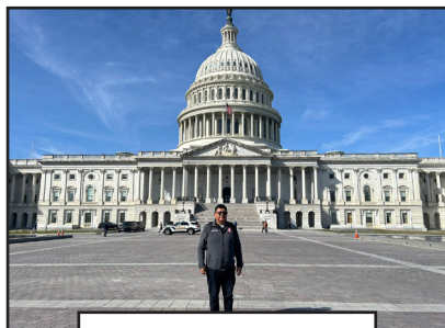
Visit to the U.S. Capitol

In my free time some of the places I visited included: The Basilica of the National Shrine of the Immaculate Conception , the Franciscan Monastery of the Holy Land in America , Washington National Cathedral , United States Capitol , the White House , Botanic Gardens , National Museum of African American History and Culture , National Museum of the American Indian , Washington Monument , Thomas Jefferson Memorial , Arlington National Cemetery . I also took a day-trip to Baltimore, Maryland where I visited The Basilica of the Assumption , Cathedral of Mary Our Queen , and the National Aquarium . Through my exploration of Washington, DC, Virginia, and Maryland, I became an “expert” with the public transportation system!