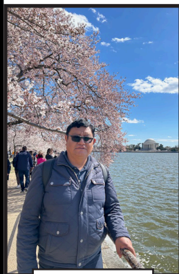
Visit to the Cherry Blossom Festival

My ~ 2-month stay with the Marists in the United States re-emphasized this meaning of Family. The purpose of my visit was to advance my English skills before attending the Marist international Annual Review Consultation (ARC) meeting in Rome in May with the other Marist Superiors from around the world. In order for me to understand a language it is important that I understand the culture. This came naturally through the warm hospitality I received throughout my visit in the United States.