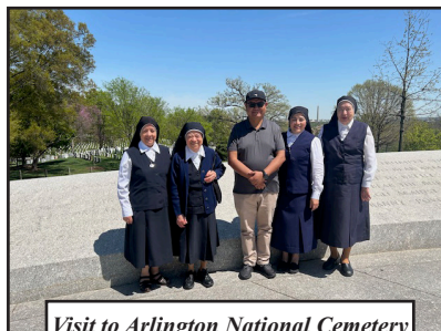
Visit to Arlington National Cemetery with the sisters

I also had the opportunity to visit the Marist communities in Atlanta, Georgia and Boston, Massachusetts. I always experienced the Marist “Family Spirit” and never felt like a stranger.